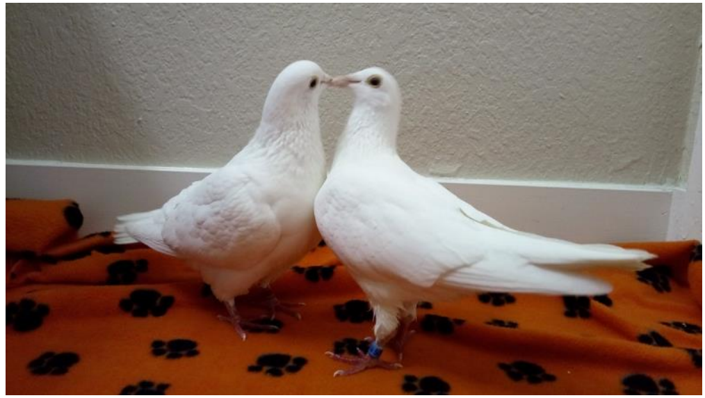
Married couple kisses