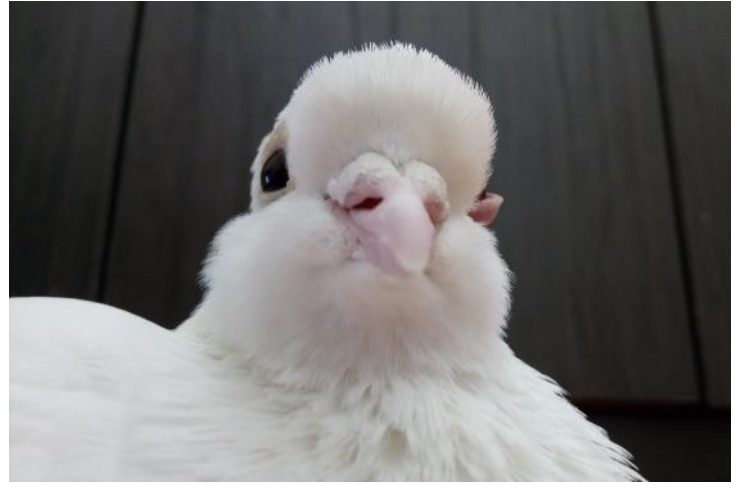
Rose contentedly loafing post-bath.

a pigeon. I would also highly recommend adopting from Palomacy–working with Palomacy has genuinely been the best rescue experience I've ever had, and I've worked with countless rescues. Palomacy truly understands the value of these birds and the people who bring them into their lives.